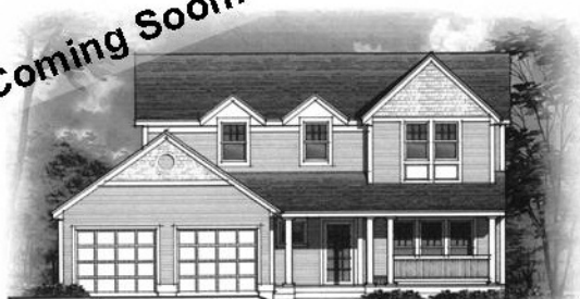
STONE BROOK VILLAGE SOUTHBOROUGH

(508) 357-8825 259 TURNPIKE ROAD SOUTHBOROUGH, MA 01772 CapitalGroupProperties.com