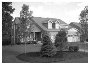
Grouse Hill Sudbury

Capital Group Properties. It's evident in the details.™