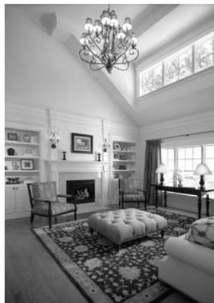
Mahoney Farms Sudbury