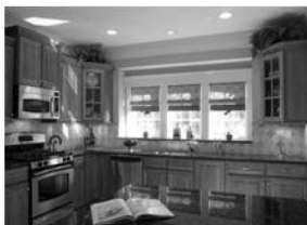
Deerfield Estates Hopkinton