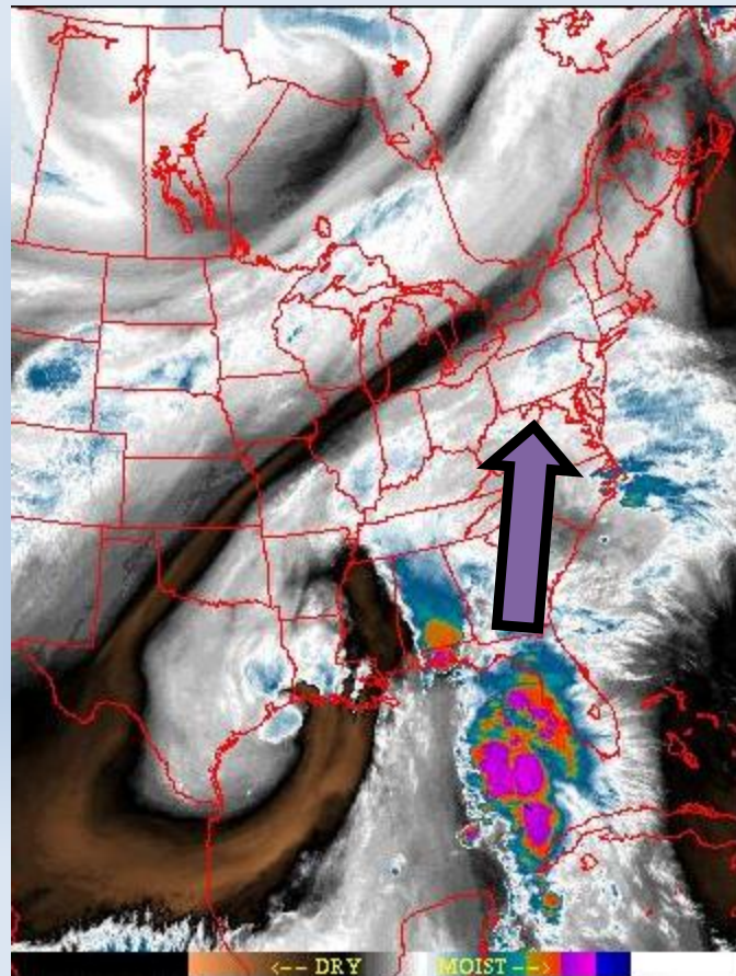
Latest satellite water vapor imagery shows lots of moisture heading northward

The combination of a slow-moving frontal boundary and lots of moisture coming north from the Gulf of Mexico will bring a period of heavy rainfall for late Tuesday into Wednesday.