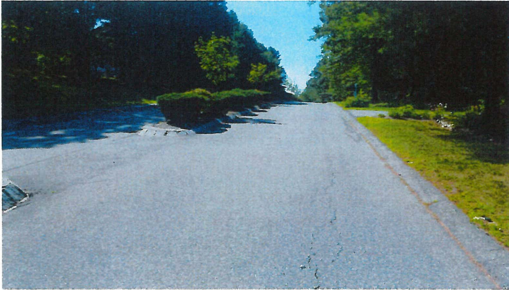
Picture-2. View from opening at 4 Davis Rd toward Ashley Rd