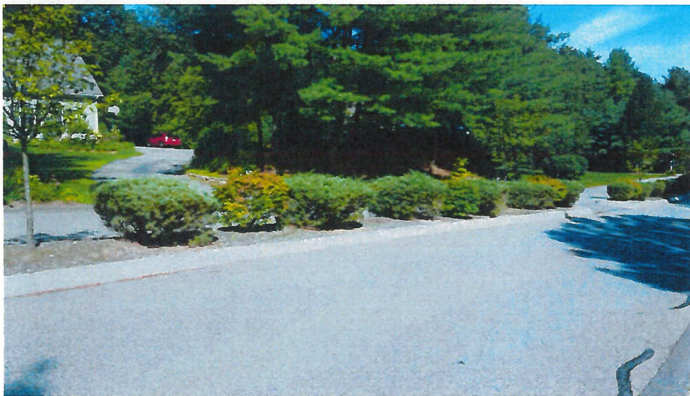
Picture-3. View toward driveway at 7 Davis Rd.

Therefore, we kindly request the Board of Selectmen to grant permission allowing DPW to widen the cut at 4 and 7 Davis Rd as shown in the following sketch: