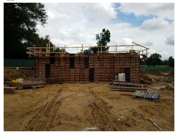
Photo depicts the Golf Clubhouse foundation walls ready for concrete pour on 7/26/18.