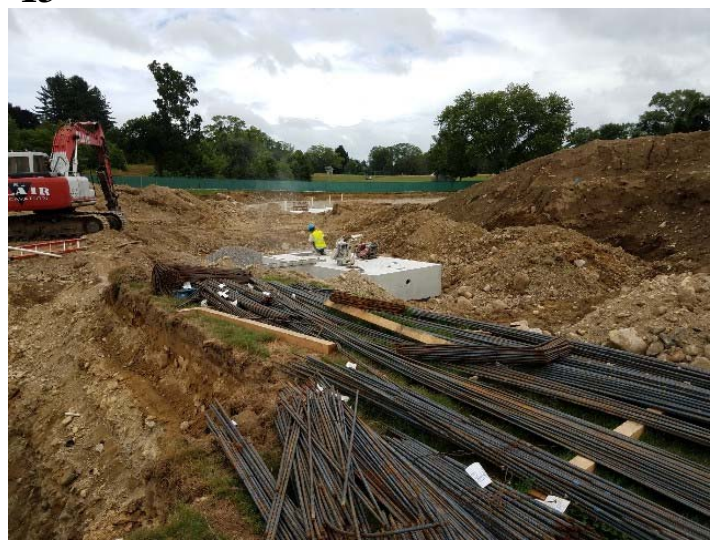
Photo depicts the delivered Public Safety Bldg. steel rebars on 7/25/18.