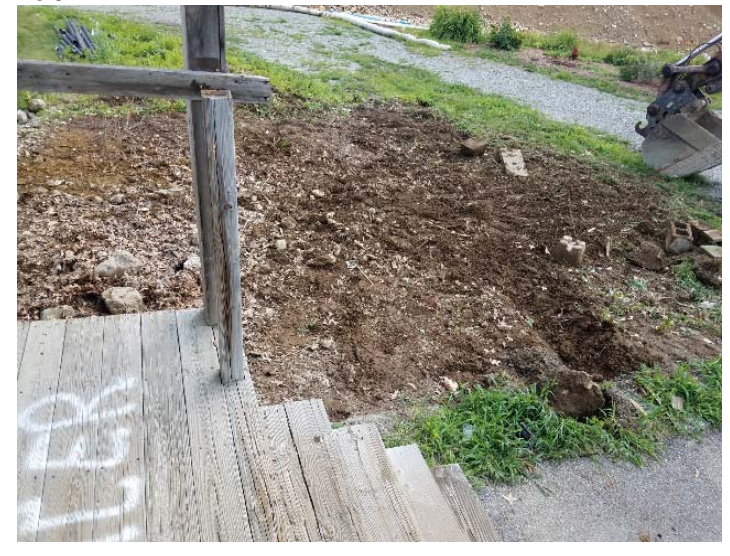
Photo depicts the complete demo of the Golf Clubhouse wood deck on 6/26/18.