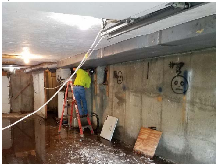
Photo depicts CAM HVAC demo of the Golf Clubhouse basement AC ducts on 7/27/18.