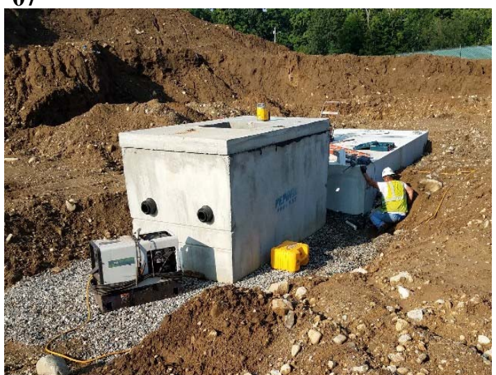
Photo depicts progress of the Septic tanks installation work on 7/26/18.