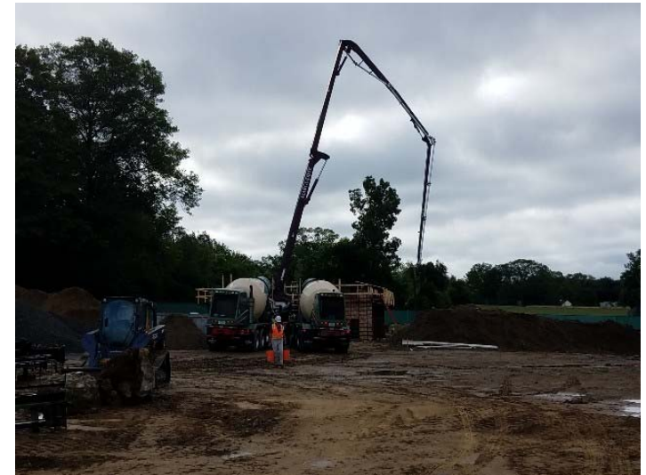
Photo depicts the Marguerite Concrete foundation walls concrete pour on 7/26/18.