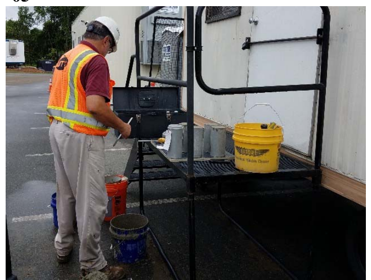
Photo depicts the UTS of Mass concrete inspection and testing on 6/26/18.