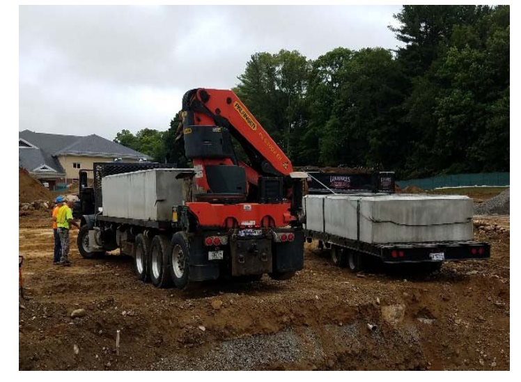
Photo depicts the 11,000 gallon septic tanks delivery and installation on 7/23/18.