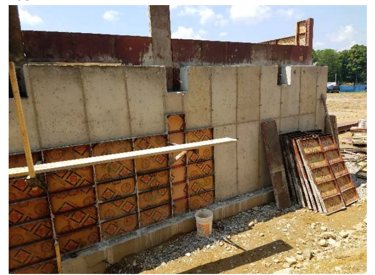
Photo depicts Marguerite Concrete stripping foundation forms from new Golf Clubhouse foundation on 7/27/18.