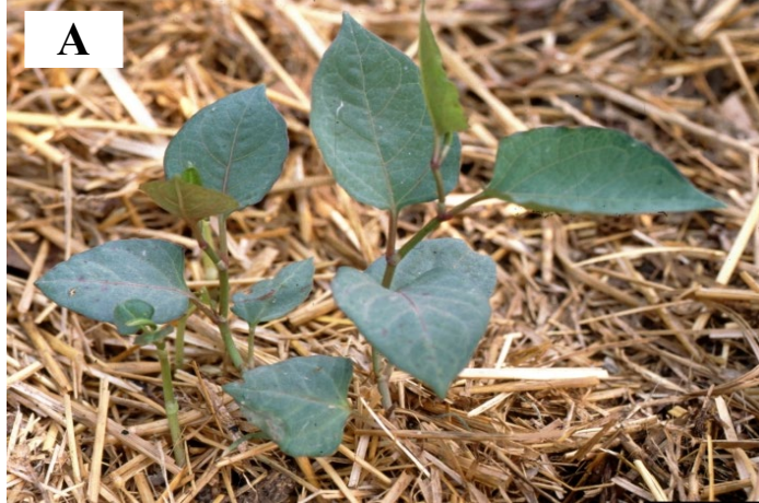
A. Japanese knotweed seedling