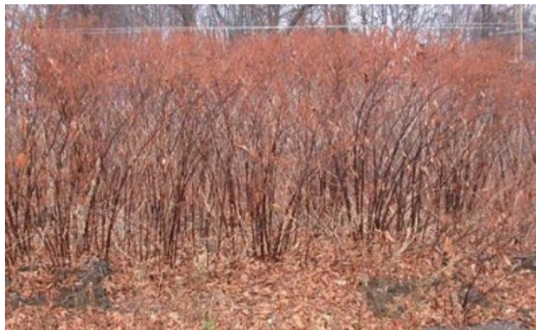
Stand of Japanese knotweed in the winter after stems have dies back