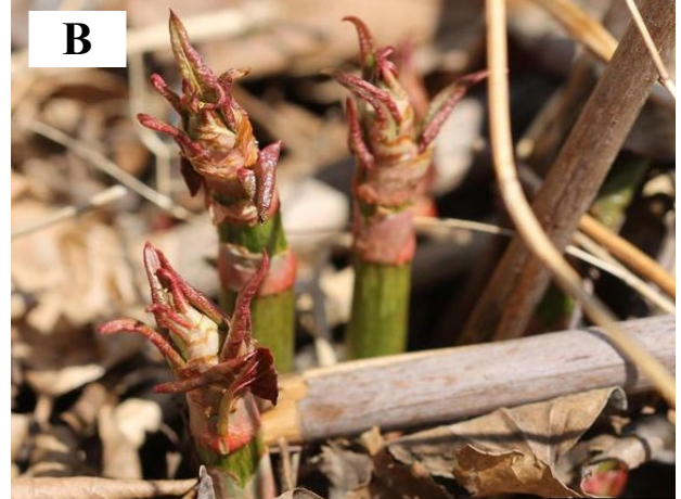
B. Established Japanese knotweed emerging in spring from rhizomes among dead canes from a previous growing season.