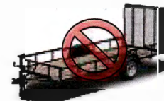
(3) No utility trailer over 10 ft. long

FOR INFORMATION ABOUT DISPOSAL OR FUNDRAISING CALL THE TRANSFER STATION (508) 485-2511 or DPW (508) 485-1210