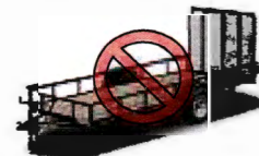
(3) No utility trailer over 10 ft. long